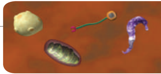
A variety of yeasts, bacterial infections, viruses, and parasites must be evaluated.

Pain and sleep disturbances are addressed in this component which may include the management of sleep issues and pain through medication. This is, in general, a "stop gap" phase meaning that as the treatment progresses and the underlying problems are addressed, the medications that "mask" the symptoms are no longer needed. The majority of